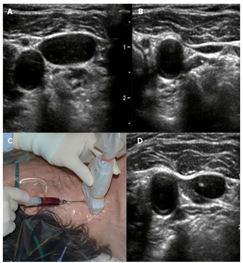
Fig 3 (A) Ultrasound image of the right internal jugular vein (no compression). (B) Ultrasound image of the right internal jugular vein compressed by the probe. (C) Insertion of needle under real time ultrasound guidance (out of plane). (D) Ultrasound image (out of plane) of needle in right internal jugular vein (echogenic (white) spot in centre of vein)